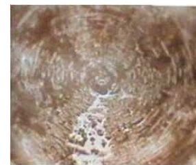
Heavy Metal Music

The water crystals become disarranged or hideous scribble when exposed to negative words or music: