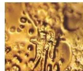
You Make Me Sick, I Will Kill You

Romans 1:20 says “For the invisible things of Him from the creation of the world are clearly seen, being understood by the things that are made , even his eternal power and Godhead; so that they are without excuse.”